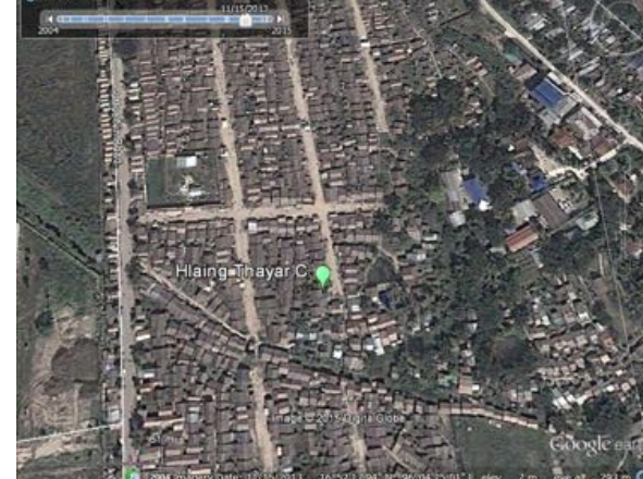
Figure 1: Satellite images of Hlaing Thaya before and after Nov 2013