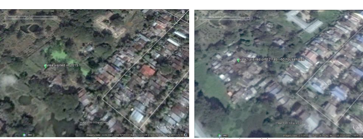
Figure 3: Informal settlements in Thaketa, 2007 (L) and 2015 (R)

The researcher visited 3 informal areas in Thaketa. All 3 areas were relatively small in size, comprising between 30 and 60 households each, and all were built on YCDC land. The researcher and translator found a noticeable sense of community unity in these three areas, perhaps owing to their small size and longer-term residence (average of 81/2 years in the location). Most of the squatters were originally from Thaketa itself, which may have helped create affinity. The threat of eviction was relatively low due to good relations with the local authorities. Elsewhere this threat can create divisions where longer-term squatters feel they have more rights than the recent arrivals. Finally, it may be that a greater communal sense is possible in a neighborhood where incomes are more or less equal. As previously discussed, the larger periphery settlements had a greater variation in income. Wealthier residents include the Heads of 100 Households, the owners of wells and electrical generators, and residents along major roads having home-based businesses.