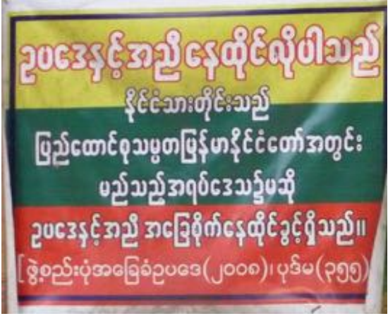
Figure 2: Poster with a citation from the 2008 Constitution

A recent informal study by UN Habitat also tentatively found that Hlaing Thayar has the highest occurrences in Yangon of disease related to poor environmental conditions and lack of water & sanitation facilities (diarrhea, dysentery, malaria and tuberculosis). Hlaing Thayar